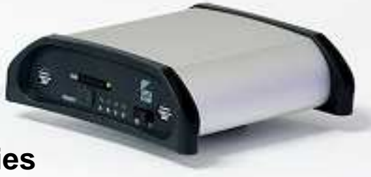
Aplicom C-series Aplicom Regatta