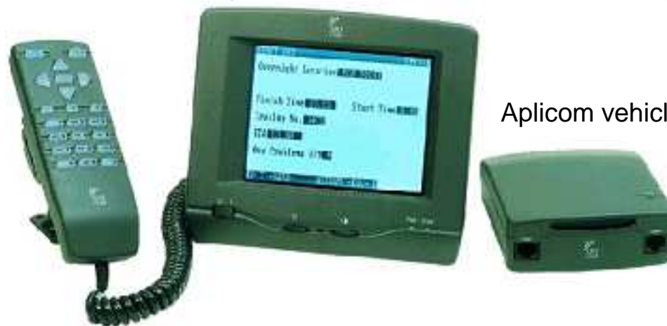
Aplicom vehicle workstation from 1995