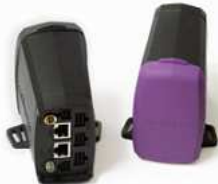
Aplicom A1 Product Family