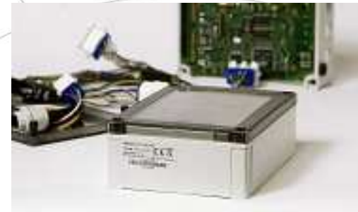
Customised OEM Products